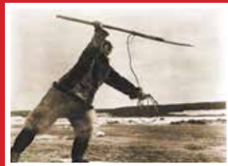
Nanook of the North (1922 silent film)

• Northern Arts and Cultural Centre • September 13th | 7:30pm